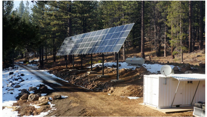
Picture of Sagehen Microgrid in California

The emergence of system integrators that incorporate wind, solar, battery, and generators into both custom and modularized microgrid solutions has been prevalent over the past 10 years. These integrators range from large general and electrical contractors, to small startup companies developing containerized solutions. Typically, their intellectual property is the software around system control and integration; and although the system is focused on a renewable solution, they often seek the resiliency of a fossil fuel generator. In California this past year, there were examples of microgrid systems consisting of solar and battery that were unable to perform due to smoke created by wildfires. Adding generation to the system ensures it can operate 24/7/365. In remote areas “off grid” where natural gas supply is not available, the microgrid can leverage the ability of many generators to operate on propane, LNG, CNG and other gaseous fuels.